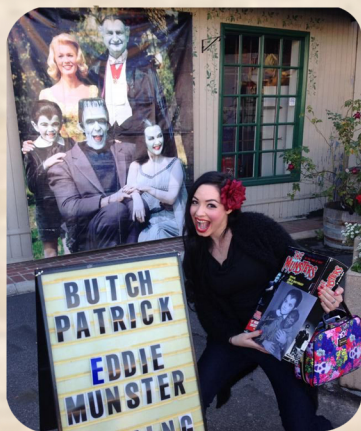
TV Show Memorabilia